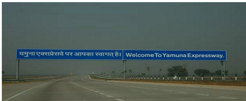
Figure 1: Yamuna Expressway

Driving safety is of importance in the transportation infrastructures. Skid resistance has for some time been perceived as the most vital parameter in diminishing highway user crashes particularly in wet conditions. The learning of the friction coefficient and skid resistance is incredibly huge information for safety redesign of roads. The Times of India reported that Yamuna Expressway (Fig. 1) Failed to control accidents as tyre blowouts continue to cause accidents. On 27th March 2013, a Maruti Wagonr flipped further than a few circumstances because of a busted tire on the speedway bringing about four persons getting harmed, one of whom remains critical. Information of the most recent eight months, since the expressway was thrown open, demonstrates that almost 40% of the 20 accidents, which left 10 people dead and a few others harmed, have been because of tire blasts.