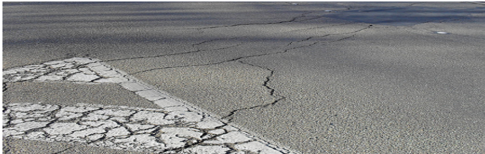
Figure 3: India to stop paving any more roads with bitumen roads

The present situation of India is not really 2 percent of the country's road length developed from concrete; there is great degree for enhancing the life of pavement and quality of roads through concretization as it offers a few particular points of interest over streets with bituminous surfaces. Transport minister Nitin Gadkari proposed utilizing cement for road development in light of the fact that it is far durable and less expensive to keep up than bitumen despite the fact that it is generally costly at the start. The thought is that utilizing cement will cut down the cost of upkeep fundamentally.