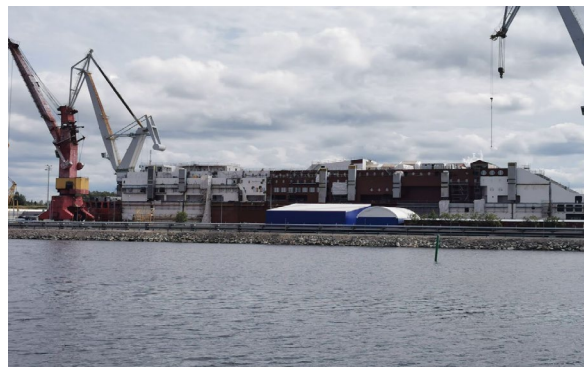
Figure 3: Figure 3. M/S SPIRIT OF TASMANIA IV, under construction in Rauma, Finland