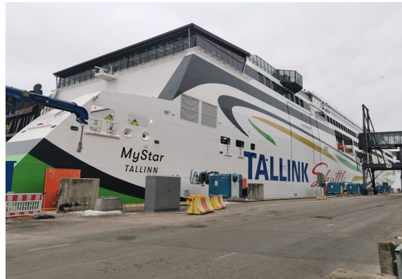
Figure 1: M/S MyStar arriving in the port of Helsinki, six mooring pads activated via AIS

The second ship included in our investigation is the Passenger ferry M/S AURORA BOTNIA (Technical Specification NB 6002, 2019) delivered 2021 to Wasa Line and operating route Vaasa, Finland – Umeå, Sweden with 2-3 daily departures. She is a dual-fuel ship but also has batteries. Its Engine room is bigger than M/S MyStar with more monitoring and maintenance tasks for engineers. Currently, they have started to use biodiesel every Friday.