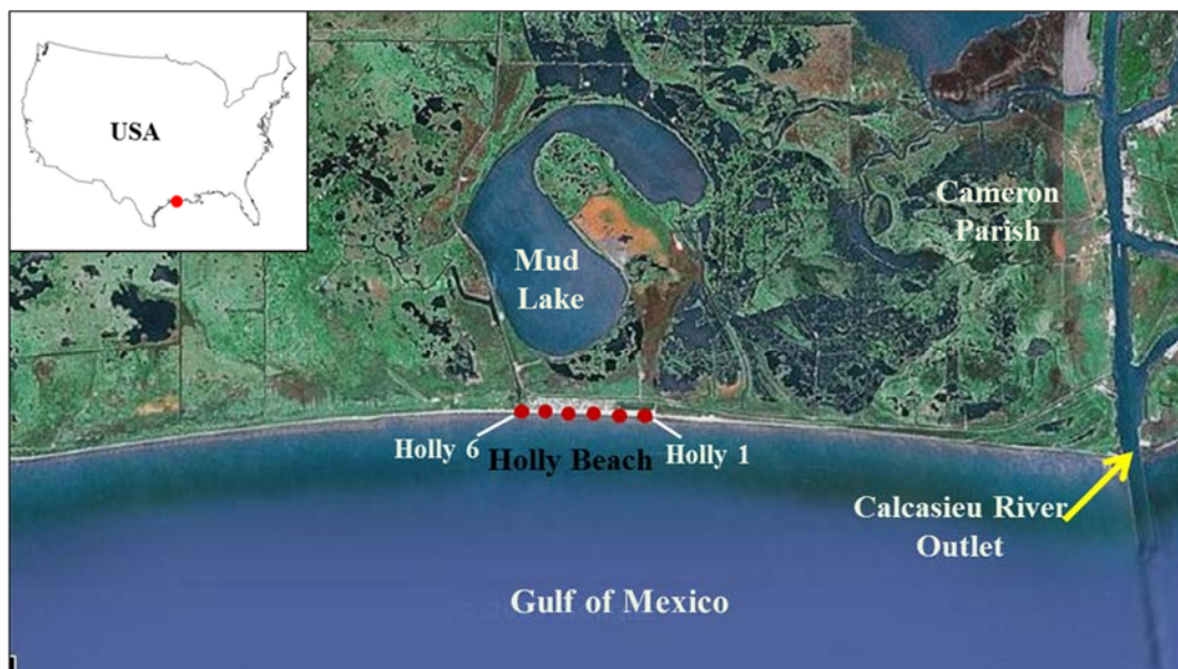
Figure 2: Location of study beach sites