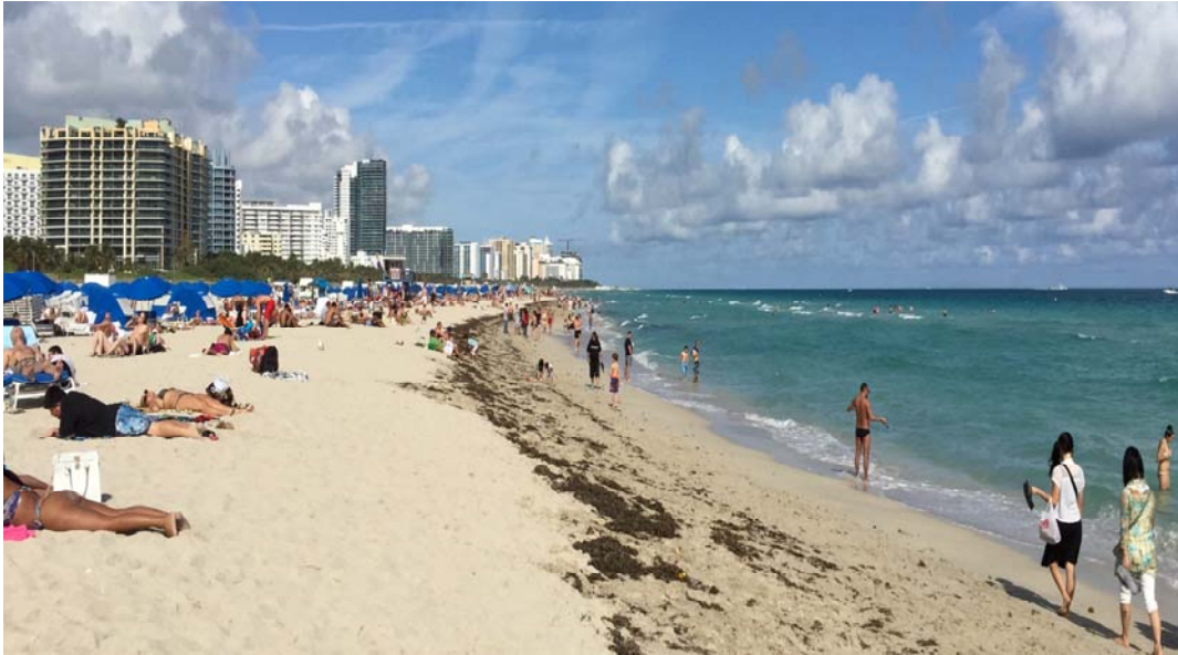
Figure 1: A typical beach holiday without swimming advisory

addition, bacterial levels in recreational beach waters generally vary in a wide range and they are commonly measured using the most probable number (MPN). Mathematically, MPN could be best described with probabilistic models like Bayesian models.