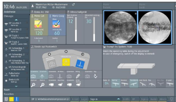
Figure 1: Graphical panel with workflow bar (lower side).

workflows during surgery as well as during reprocessing of reusable instruments and devices. The integration concept is based on the open communication standard IEEE 11073 (Kasparick et al. 2015). RFID equipped instruments help to monitor automatically each step of operation and to provide related information on the central surgical workstation if needed. The option to perform bulk reading of RFID equipped instruments also enable to check completeness of instruments sets during reprocessing and packaging as well as during surgery while searching for a specific instrument in the local OR stock during an intervention. The OR.NET approach opens the door towards the Internet-of-Things (IoT) in the operating room, providing open standards for interoperability of different devices and multisensor networks for computer-assisted knowledge based workflow navigation and monitoring. Figure 1 and Figure 2 shows an exemplary panel of the OR.NET surgical workstation developed in our lab with the workflow navigation bar and integrated checklists.