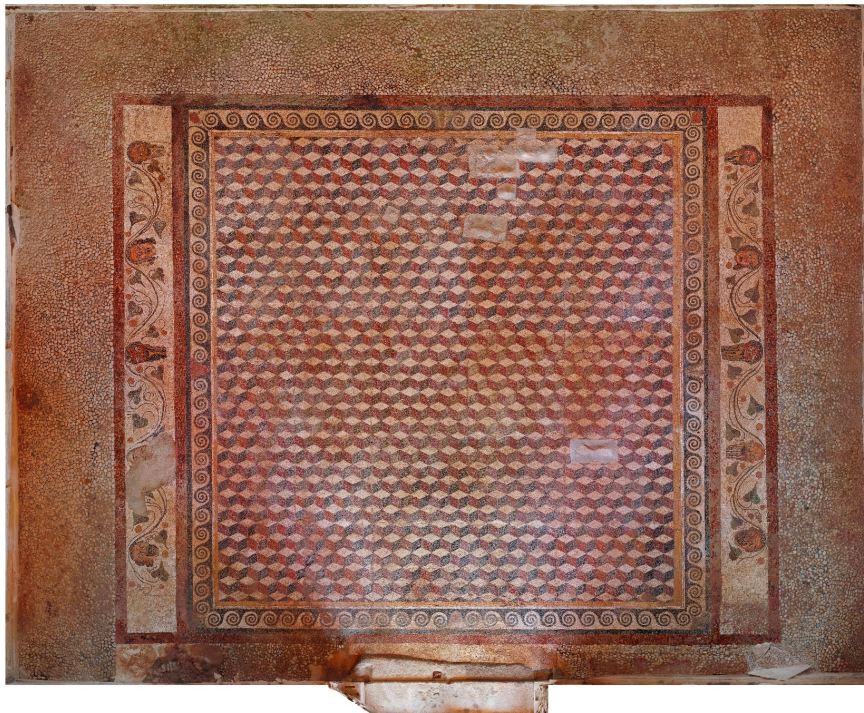
Fig. 1. Orthophoto of the mosaic of the Masks, 9.12 x 7.09 meters (by C. Maris)

The mosaic under study, measures 9.12 x 7.09 meters and features a central geometric pattern consisting of '3D cubes', a recurring geometric pattern in Hellenistic mosaics, characterized by the depiction of cubes arranged in a three-dimensional manner. The central pattern is bordered by a decorative band of waves, with two lateral bands on the east and west, each showcasing five theatrical masks, interwind with floral motifs. The outer band is plain giving the illusion of a big carpet placed on the floor (Fig.1).