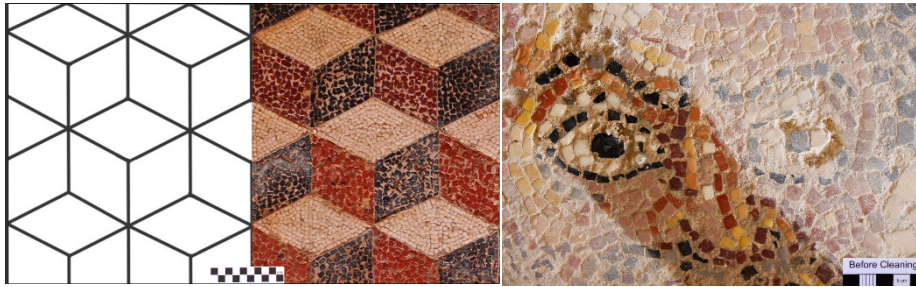
Fig. 2. Detail of the 3D cube pattern of the central mosaic carpet (photo and drawing by S. Minetou).

black tesserae with wide and irregular interstices (Fig. 2). In contrast, the top of the cubes is set in opus tessellatum characterized by a well-organized andamento , using white tesserae of approx. 1 cm side arranged in concentric lozenges [3]. Additionally, lead strips [4,5] are used to define the sides of the rhombuses that form the three-dimensional cubes and the outlines of the waves. Opus vermiculatum is used in the masks and opus tessellatum in their background, the floral motifs and the rest of the decorative bands. Glass tesserae are used in a few details of the masks while the rest of the mosaic is made of stone tesserae.