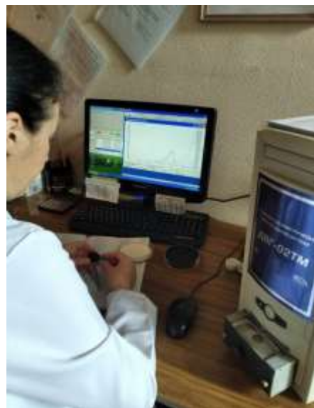
Figure 1 – IDC data acquisition in Central Laboratory of Radiation Safety and Dosimetry of Medical Exposure, Grigoriev Institute for Medical Radiology and oncology of the NAMS of Ukraine

During 2001 - 2020 the Government by its decrees has taken a decision to develop a National Register of Individual Doses of Occupational exposure [8,9]. Ministry of Health of Ukraine and State Nuclear Regulatory Inspectorate of Ukraine are responsible for work coordination concerning development and functioning of the National Register of Individual Doses. Nevertheless Central Laboratory of Radiation Protection and Dosimetry of Medical Exposure on the base Grigoriev Institute of Medical Radiology and Oncology (Kharkiv), which operates since 1979, performs the individual dosimetry monitoring of medical staff in almost all Ukrainian Regions (except Kyiv Region) (Figure 1).