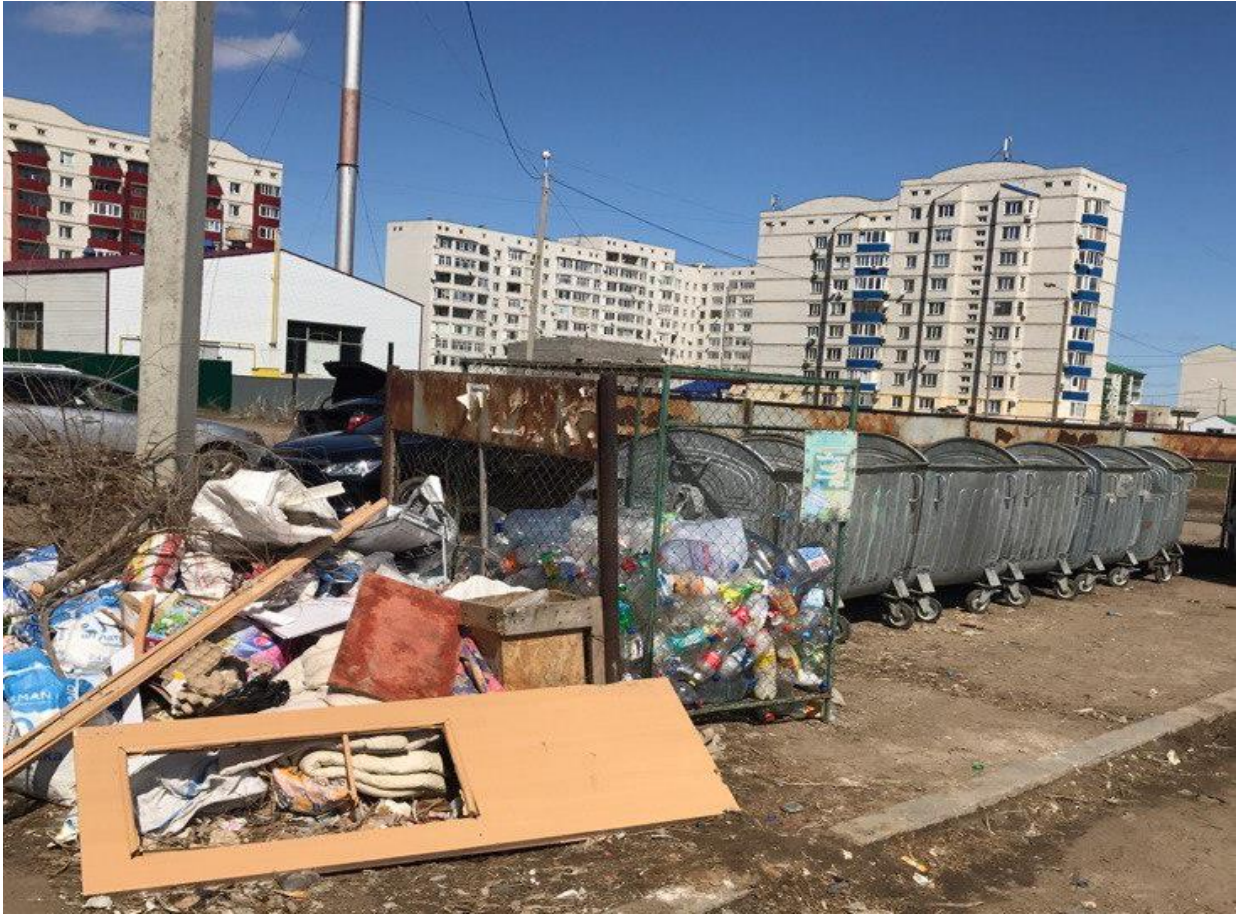
Picture 2 – The condition of the garbage containers in the city of Uralsk on the street of New Orda

As we can see, the containers are not marked with a color for separate garbage collection, garbage is taken out daily, but there are also elements of spontaneity, garbage is not always brought to the containers (picture 2).