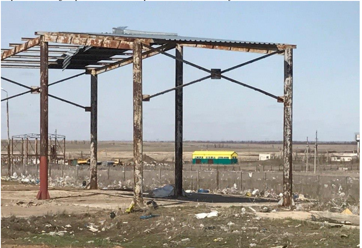
Picture 1-View of an unfinished waste processing plant at the landfill in Uralsk

In Uralsk, construction of a waste processing plant began, but due to lack of funds, construction was suspended, and only a waste sorting shop works on the territory of the landfill, where 300 jobs are involved.