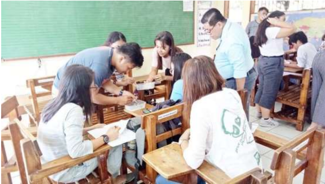
Figure 3. Evaluation of the apparatus through experimentation

The table below shows the evaluators' rating on the usability of the developed do-it-yourself gel electrophoresis apparatus. There are two questions with the highest rating and had a mean of 3.47. The respondents strongly agreed that the experiment encouraged them to participate in class and the respondents strongly agreed that the experiment was a fun learning experience. The question with the lowest rating had a mean of 2.95. The respondents agreed that the experiment helped them understand the nature of DNA and more. Although this was the lowest, the rating still aligned to the positive side of the scale. Overall, the respondents rated the usability of the apparatus with an average mean of 3.27.