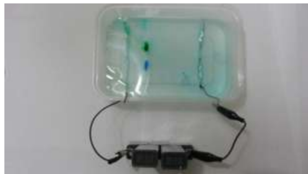
Figure 2. The developed do-it-yourself gel electrophoresis apparatus